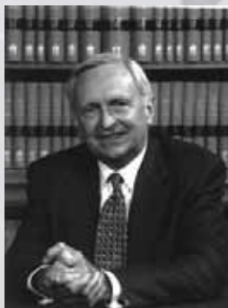
Dr. Ronald Breslow Columbia Bio-organic Chemistry