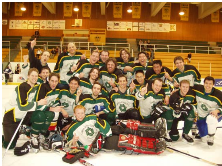
The chemistry department's mens ice hockey team . last week, finished their terrific season, winning the Division 4 championship in a thrilling shootout.